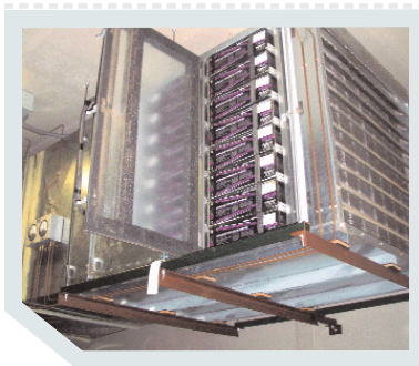
PURAFIL SIDE ACCESS SYSTEM AT THE UNIVERSITY OF GEORGIA JOURNALISM BUILDING, ATHENS, GEORGIA