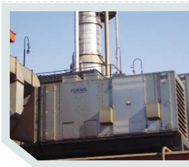
PURAFIL DEEP BED SCRUBBER AT TUPRAS IZMIT REFINERY IN TURKEY